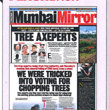
Sule at the 'Save Aarey' protest; Mirror's sustained coverage of the issue

endangering various other wildlife in Aarey forest for creation of commercial maintenance car shed for Metro 3, despite there being various other options (sic)," the letter states further.