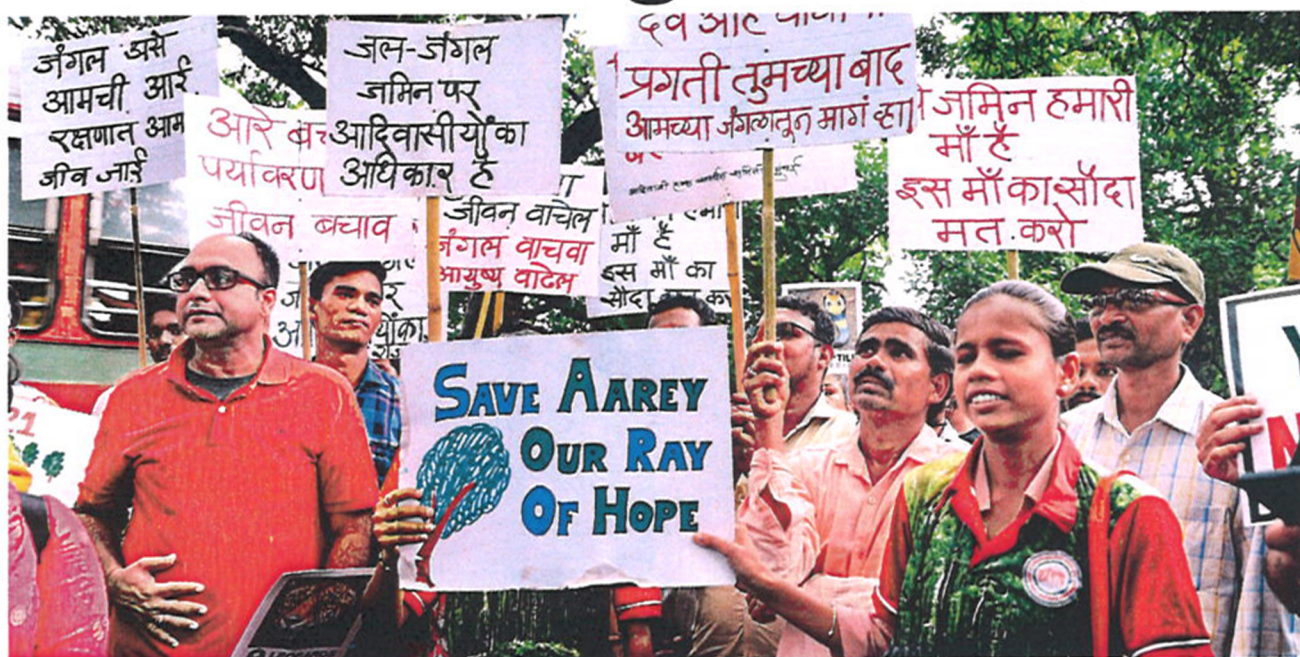
Citizens protesting against decision to cut Aarey Colony trees