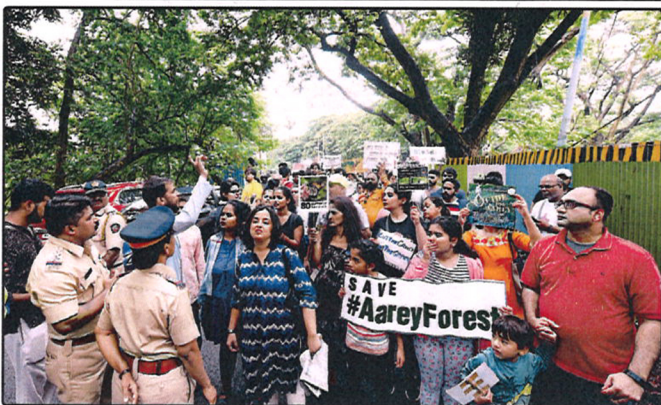
Protests against the cutting of Aarey trees; (extreme right) Mumbai Mirror's coverage of the Tree Authority's decision

"If the Aarey is concretised, excess rain water will run off into Mithi, leading to flooding at airport," said a report that was part of the dossier given to all Tree Authority members before last week's meeting. Nobody even mentioned this report